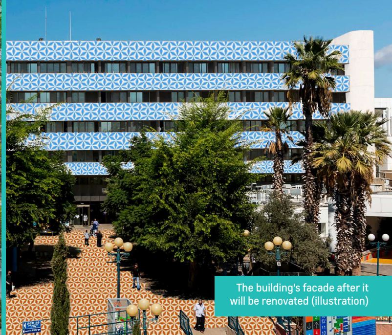
The building's facade after it will be renovated (illustration)