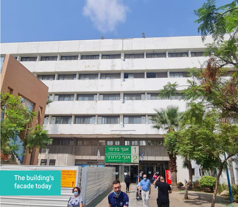
The building's facade today