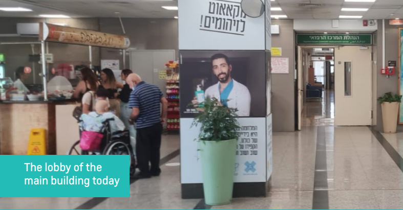
The lobby of the main building today